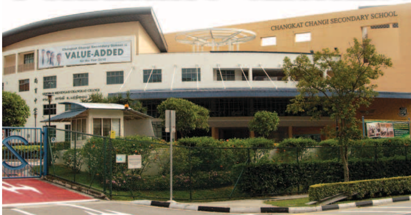
Changkat Changi Secondary School & Singapore Basketball Centre – The Centre Of Gravity And Heart Of East Zone & South Zone COE 13 & Under Training

W hen the National Centre of Excellence (COE) 13 & Under developmental program first started back in 2007, it has only 2 training centres (i.e. players from the South & West Zone were housed in 1 training centre & players from the North & East Zone were housed in 1 training centre). A year later, expansion of the program took place and 3 training centres were set up (i.e. players from the West Zone were housed in 1 training centre, players from the East Zone were housed in 1 training centre, but players from the North & South Zone were housed in 1 training centre).