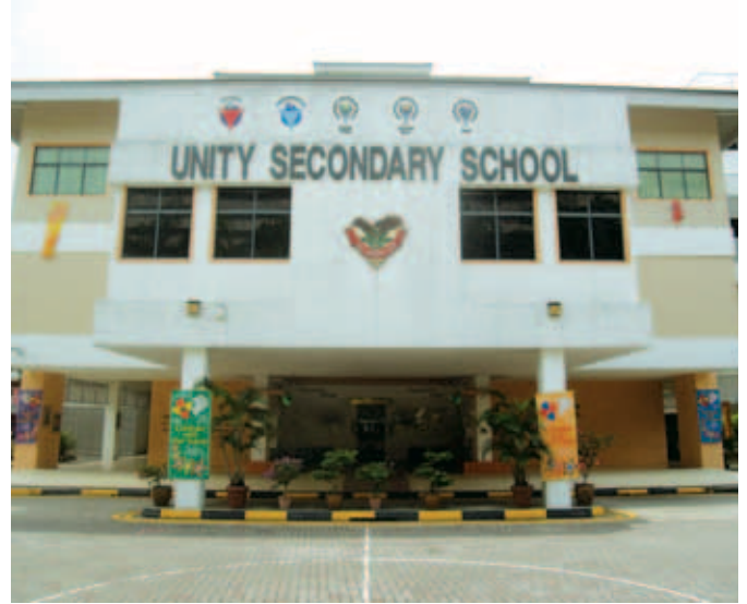
Unity Secondary School & Edgefield Secondary School – The Centre Of Gravity And Heart of West Zone & North Zone COE 13 & Under Training