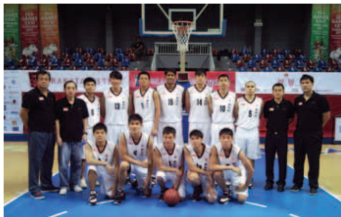
Participating In The SEABA Tournament Provided The National Men Team With More Competition Exposure, Leading Up To The SEA Games

Indeed, the fighting spirit and determination as per demonstrated by the players during the competition is simply commendable. Basketball Association of Singapore (BAS) is adamant that the competition has in one way or another raised the confidence level of the athletes and put them in good stature for the preparation of the year-end SEA Games.